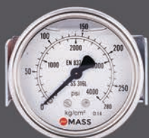
Liquid Filled Gauge