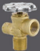
Brass Diaphragm Valve