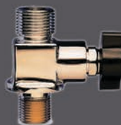
Oxygen Valves with Regulator