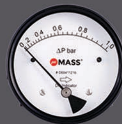
Differential Pressure Gauge