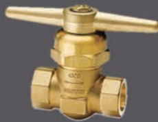
Shut Off Valve